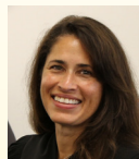
The Honorable Erin Rowe