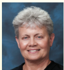
The Honorable Carol Henson

Probate Panel, Supervising Judge Superior Court of California