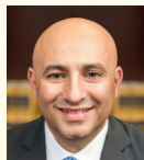
The Honorable Ebrahim Baytieh

Probate Panel, Supervising Judge Superior Court of California