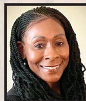
Hon. Erithe A. Smith U.S. Bankruptcy Court