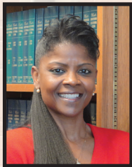
Program Chair OCBA Masters Division Board Member President OCAAJO