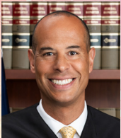
Hon. Fred Slaughter U.S. District Court for the Central District of California