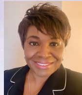
Hon. Juliet Macaulay OC Superior Court Family Law Panel