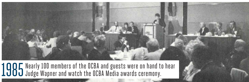
1985 Nearly 100 members of the OCBA and guests were on hand to hear Judge Wapner and watch the OCBA Media awards ceremony.