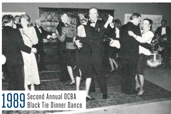
1989 Second Annual OCBA Black Tie Dinner Dance