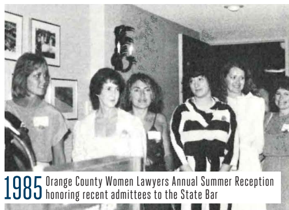
1985 Orange County Women Lawyers Annual Summer Reception honoring recent admittees to the State Bar