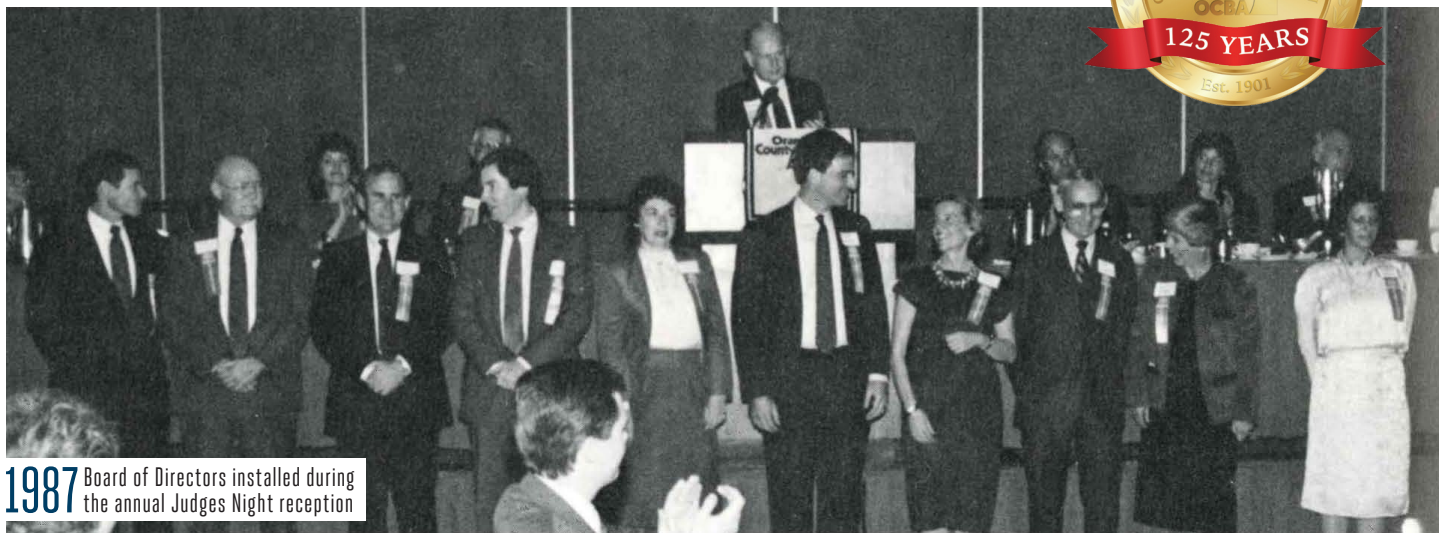
1987 Board of Directors installed during the annual Judges Night reception